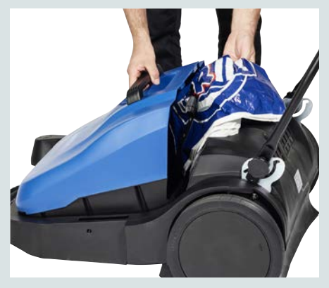
The hopper can stay in an open position so it is easy to throw big items or empty a rubbish bin into the hopper