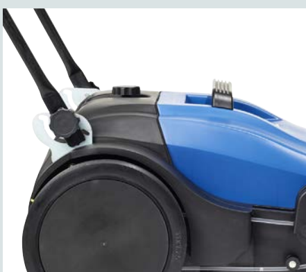
The handle can be adjusted to fit the operator height (3 positions)