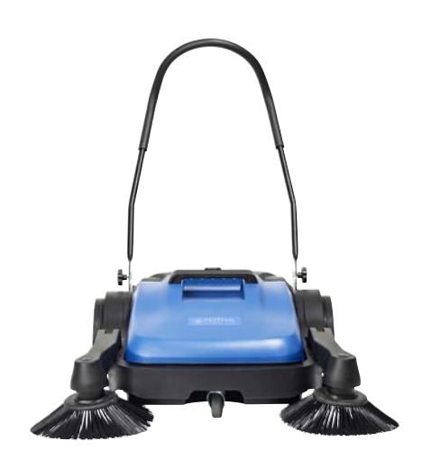
FLOORTEC 570 M with one side broom – and FLOORTEC 592 M with two side brooms – cover working widths of 70 cm and 92 cm