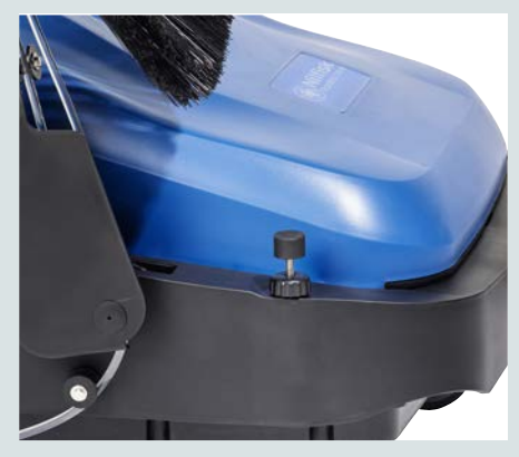
Both the main broom and the side brooms can be adjusted without using tools