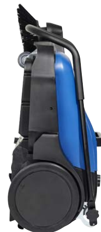
The hopper remains in place even when the sweeper is stored in an upright position or hung on the wall