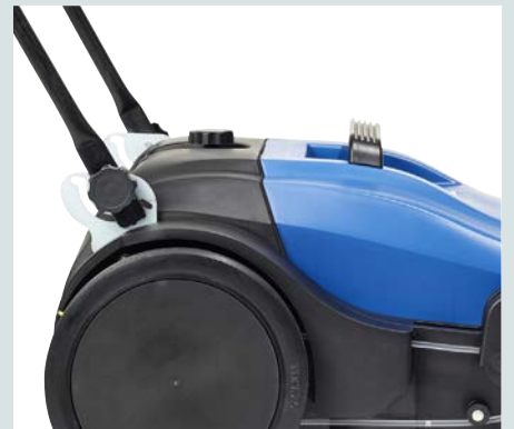
The handle can be adjusted to fit the operator height (3 positions)