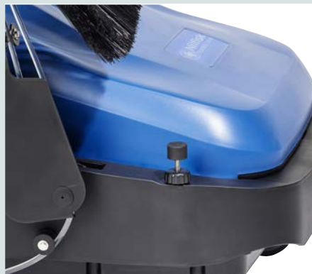
Both the main broom and the side brooms can be adjusted without using tools