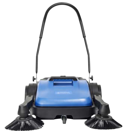
FLOORTEC 570 M with one side broom – and FLOORTEC 592 M with two side brooms – cover working widths of 70 cm and 92 cm