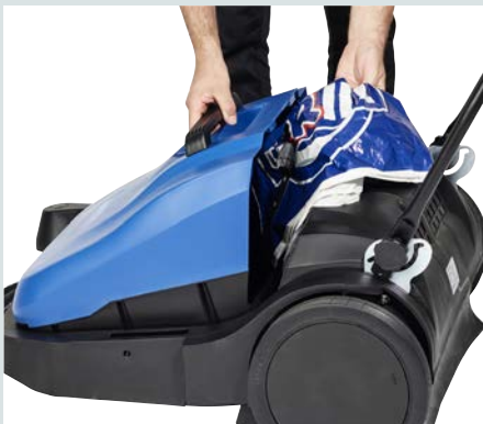
The hopper can stay in an open position so it is easy to throw big items or empty a rubbish bin into the hopper